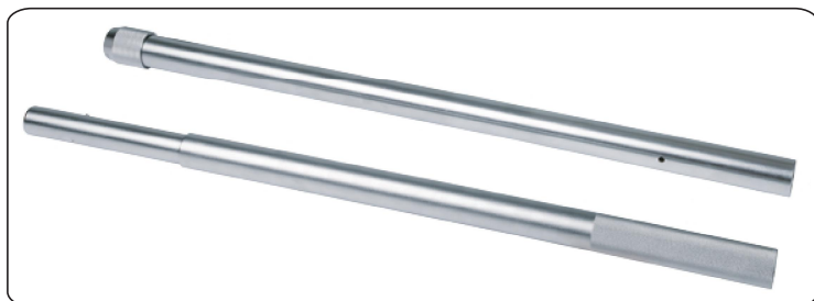
extended handle ( IST-39WM1000 , IST-39WM1500 , IST-39WM2000 , IST-39WM3000 included)