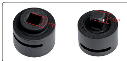
1 1/2" ratchet head (optional)